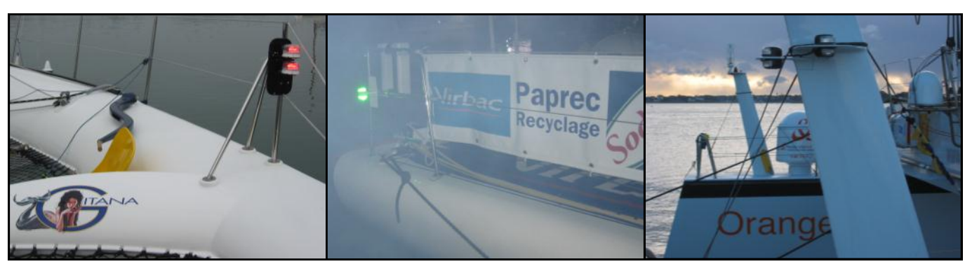
ODLight lamps onboard of Gitana11, Virbac, Orange, and... Groupama 3 , Banque populaire 4 and 5, Foncia, Volvo 70', IMOCA 60', and so on...