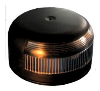
Low profile housing